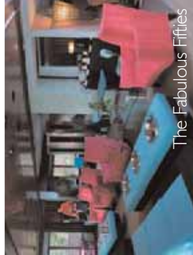
The Fabulous Fifties