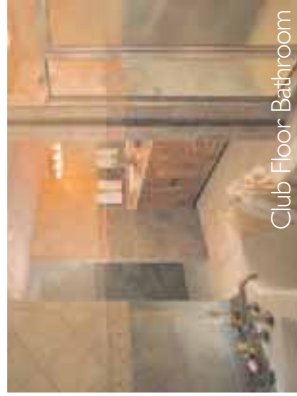
Club Floor Bathroom